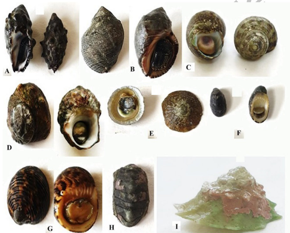
Supplementary Fig. 1. The figure showing the morphology of nine gastropod species from six families found along rocky shore of Buleji area at Karachi Sindh coast. A. Thallesea savignyi , B. Purpura persica , C. Turbosparverius , D. Lunella coronata , E. Cellana Karachiensis , F. Nerita albicilla , G. Nerita tristis , H. Ischnochiton australis , I. Astralium tentoriiformis .

2 Lasbella University of Agriculture, Water and Marine Sciences, Lasbella, Uthal.